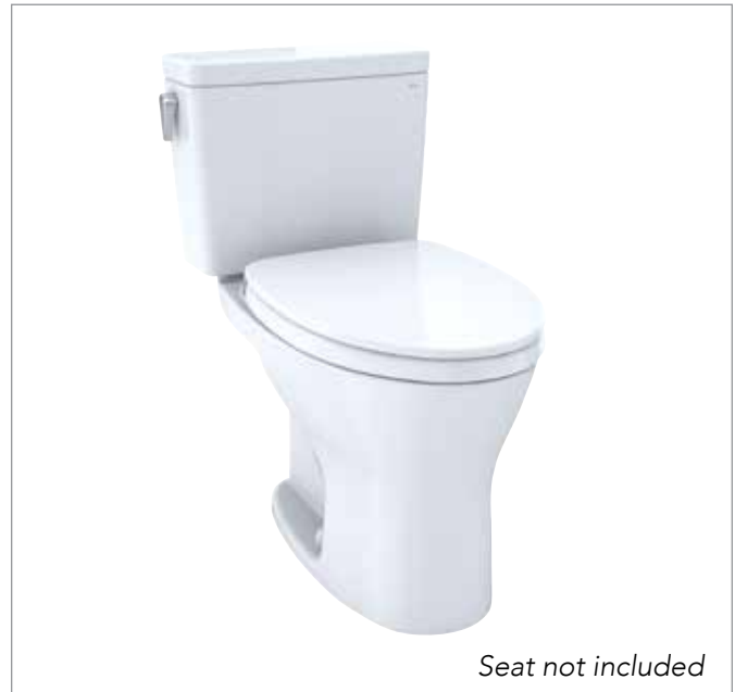
Seat not included