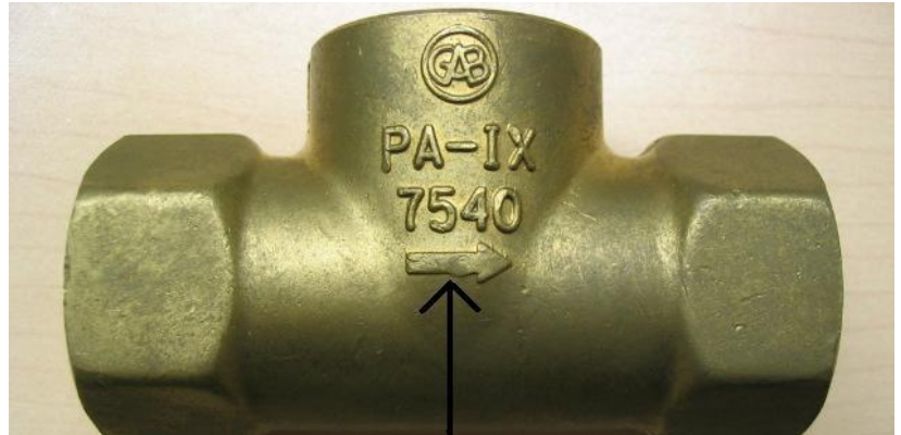
Photo 2 – shows the cartridge cavity for incoming and outgoing waterways.

This shows how water MUST be plumbed to valve body inlet and outlet ports. If this water flow direction is NOT followed the valve MUST be reinstalled.