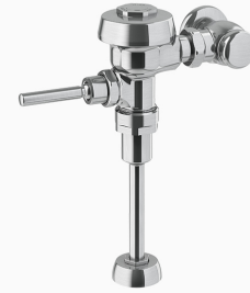
Variation Not Shown: Polished Brass