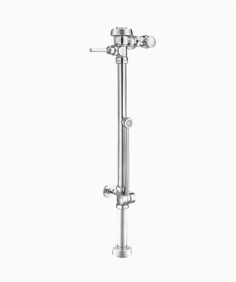
Variation Not Shown: Adjustable Ground Joint