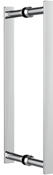
Double Door Handle shown with a small Rosette