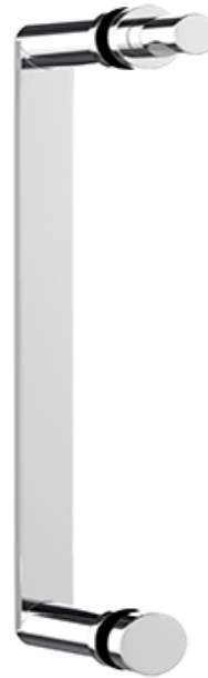
Single Door Handle with Knob shown with a medium Rosette