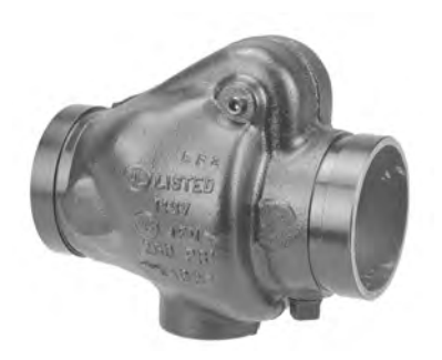
G-917-W (Reliable "G" Series)