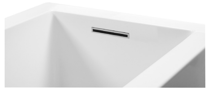
Must be specified when the tub is ordered. Available for select Designer Collection tubs only.

Sleek low profile overflow is factory-installed • Overflow measures 4.5" x 1" Provides a deeper soak • Not available for commercial applications