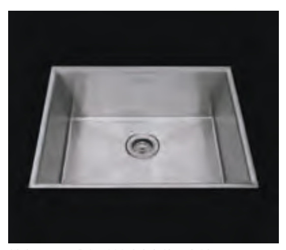
*Flush-Mount Installation Kit is included with each sink *Custom ADA compliant versions are available