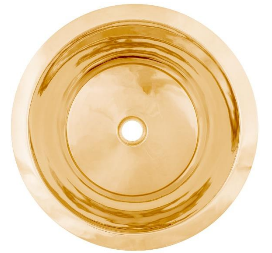
Shown in PB