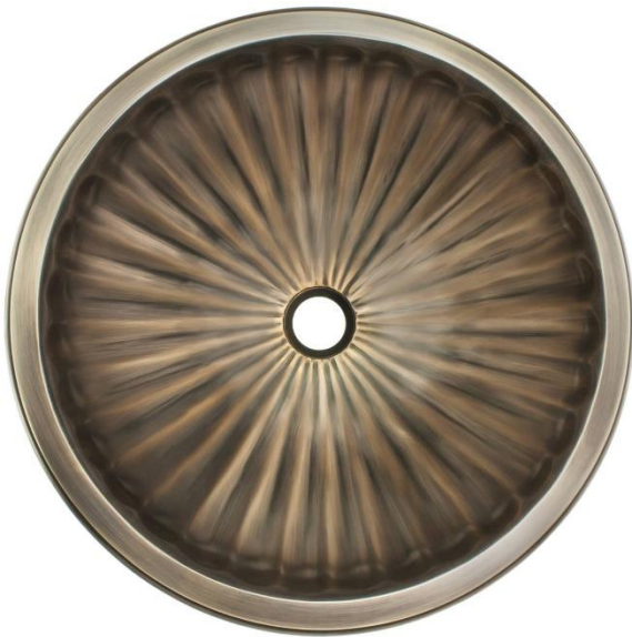
SHOWN IN AB

Linkasink warranties our product to be free from manufacturing defect for the life of the product. Warranty does not cover improper care or abuse/neglect, or changes to the living finish.