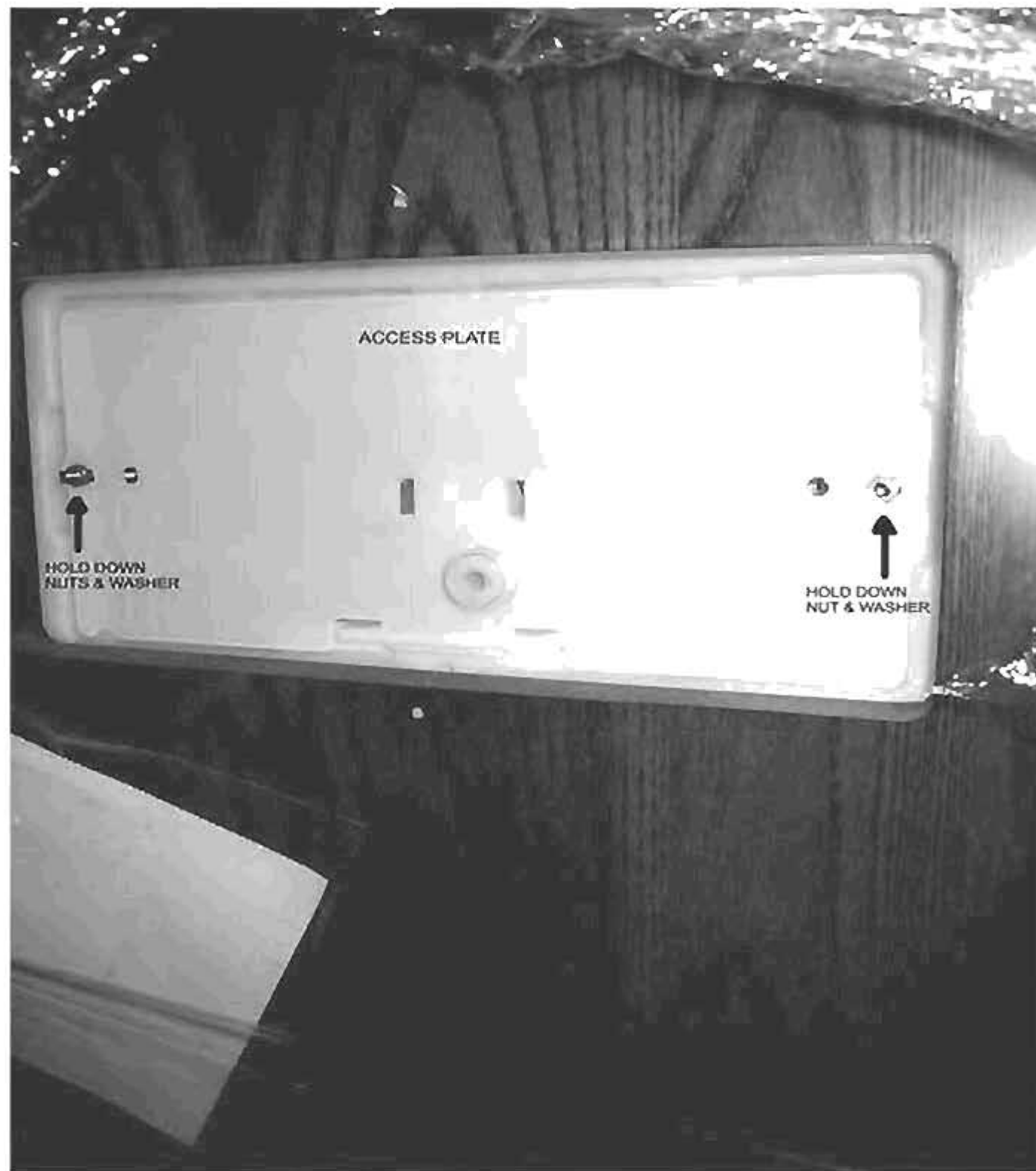
{EXAMPLE # 2}