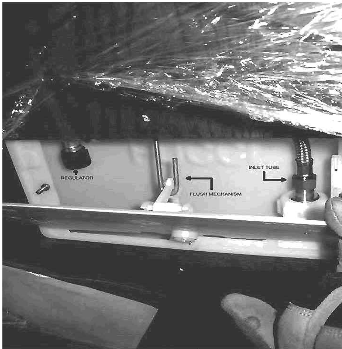
{EXAMPLE # 3}

6) TO RE-ASSEMBLE, JUST REVERSE THE PROCEDURE.