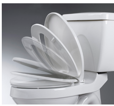
Convenient Slow-Close Feature